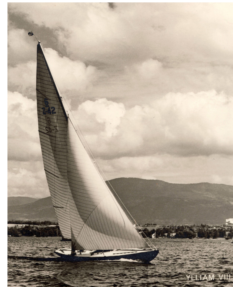
Ylliam VIII (Z42) sailing, possibly on Lac Léman in Switzerland.