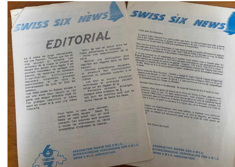
Swiss Six Newsletters from the 1990s.