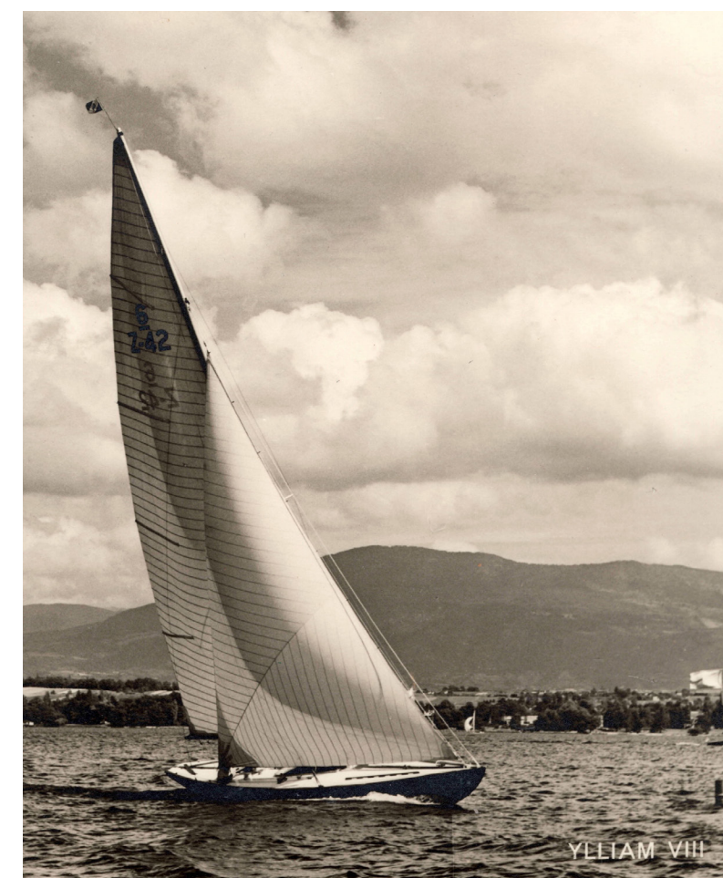
Ylliam VIII (Z42) sailing, possibly on Lac Léman in Switzerland.