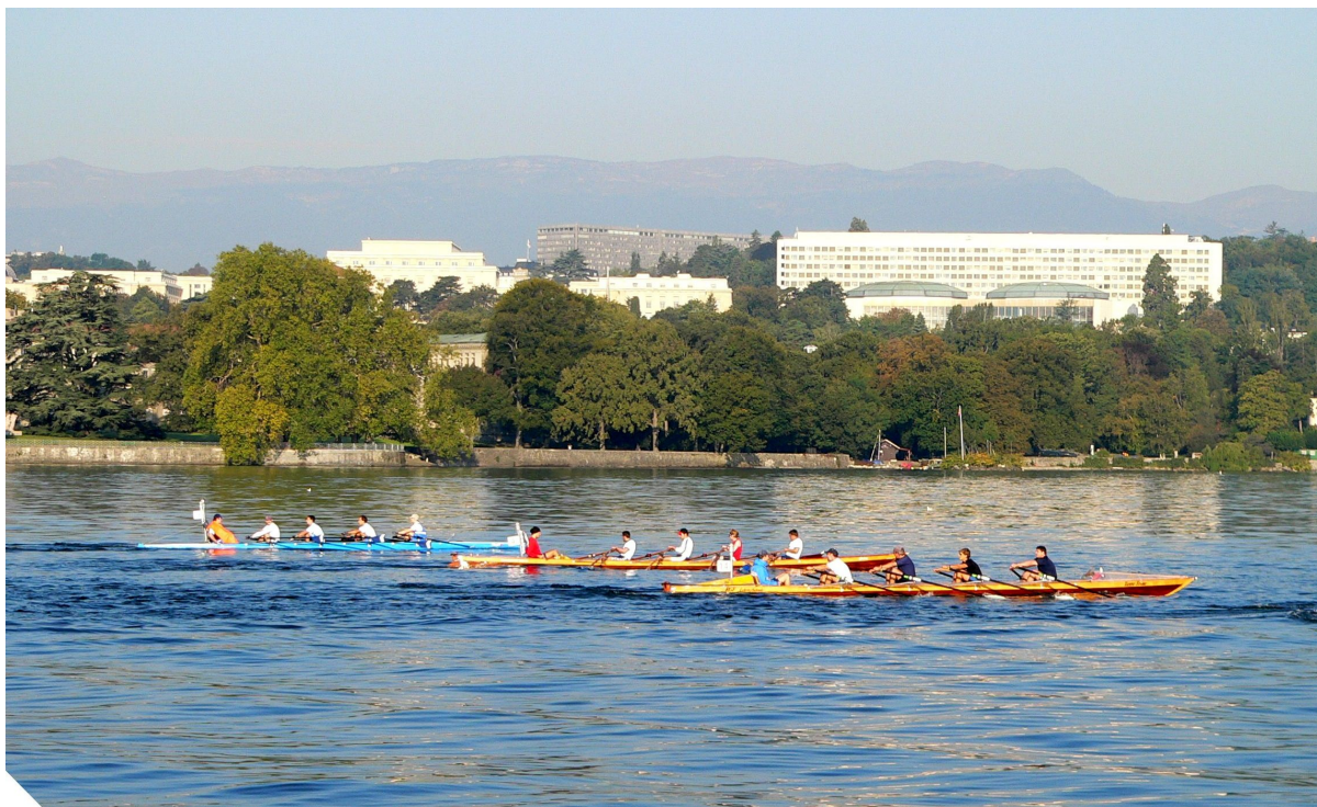
The Crews along the UN premises